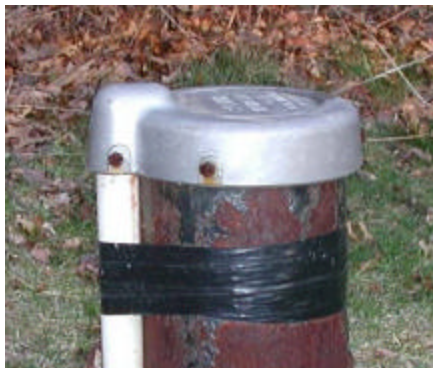
Figure 1. A standard well cap similar to those found on most Pennsylvania wells (note the bolts around the outside of the well cap).

Most existing and new wells in Pennsylvania have a standard well cap similar to the one shown in Figure 1. Standard well caps usually have bolts around the side of the cap that loosely hold the cap onto the top of the casing. The small airspace between the well cap and the casing can allow for insects, small mammals, or surface water to enter the well.