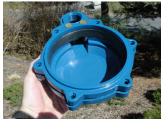
Figure 3. A sanitary well cap showing the rubber gasket, hole for electrical conduit, and screen holes for ventilation.