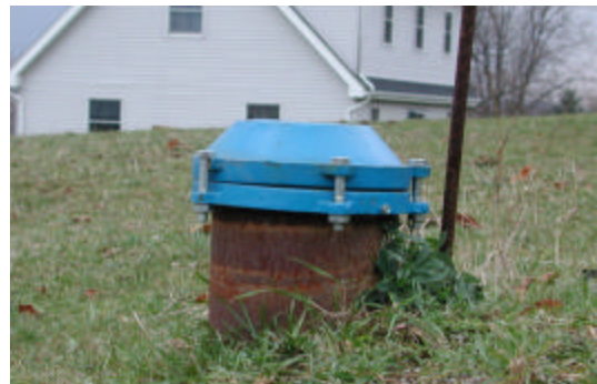
Figure 2. A sanitary well cap installed on a well casing. Note the bolts on the top rather than around the sides of the cap.

cap as shown in Figure 2. Most sanitary well caps include an airtight rubber gasket seal to prevent insects, small mammals, or surface water from entering the well and a small, screened vent to allow for air exchange (Figure 3).