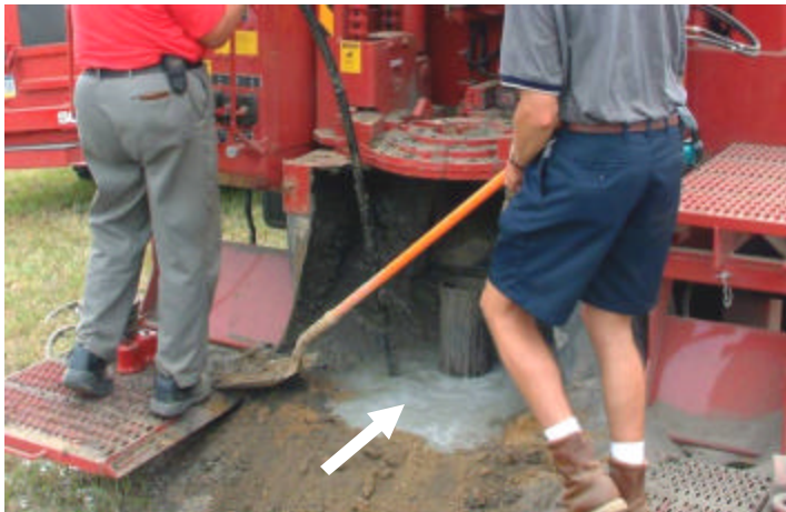
Figure 5. Well drillers use a tremie pipe to pump grout into the well. Note that the grout is now appearing at the surface of the ground around the well casing—see arrow.