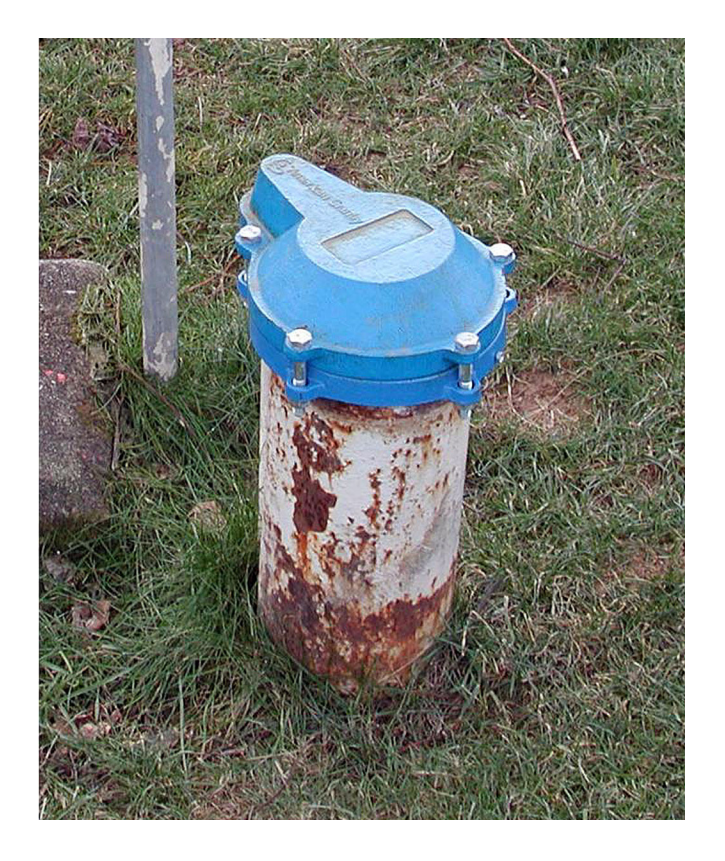
Figure 1a. Properly constructed, drilled well with a sanitary well cap.