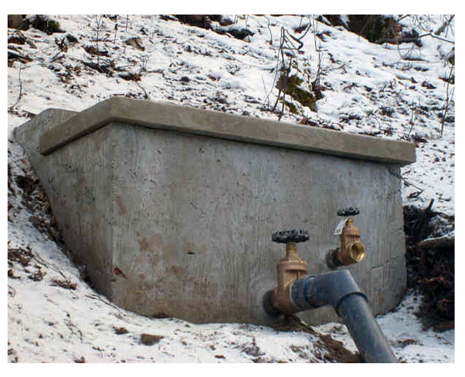
Figure 2. A properly sealed spring box will prevent surface water, insects and small animals from gaining access to the spring.

Springs are particularly susceptible to bacterial contamination because they are usually located in surface water drainage ways. A properly protected spring is developed underground and the water channeled into a sealed spring box (figure 2).