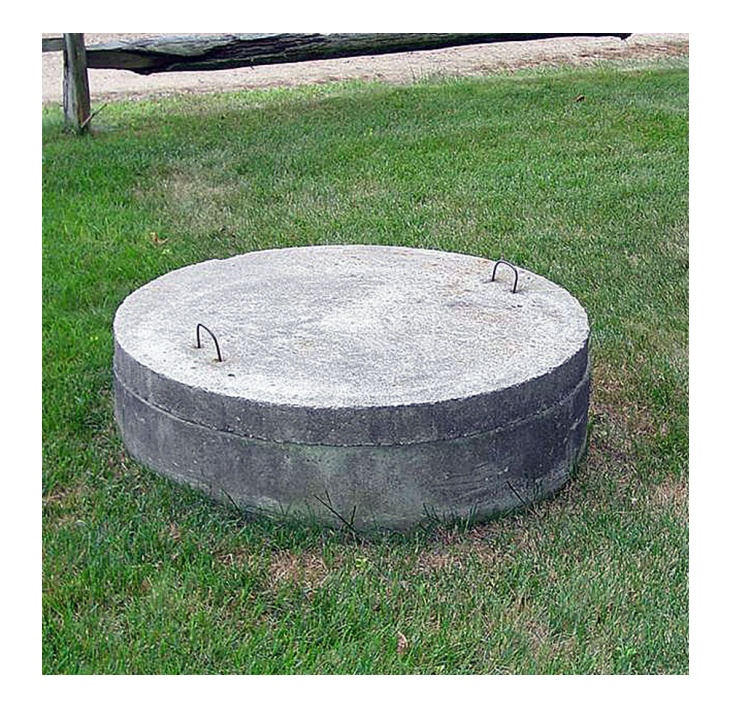
Figure 1b. A bored well with a tightly fitted concrete cap.